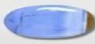
Blue Opal Lace