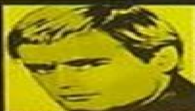
DAVID McCALLUM el favorito de T.V.