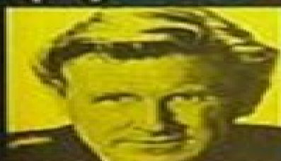
LLOYD BRIDGES el pionero del fondo del mar