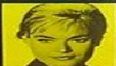
SHIRLEY EATON girl de "Goldfinger"