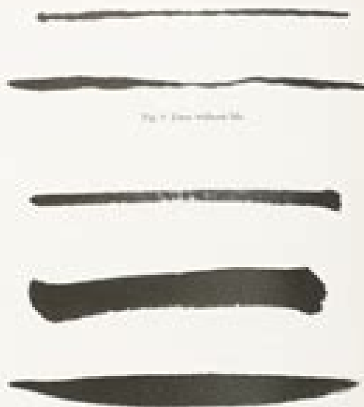
Fig. 11. Lines without life.