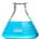
Preservatives and Artificial Flavors