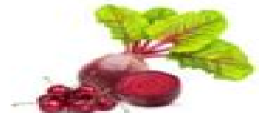
Cherries and Beets