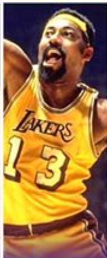
WILT CHAMBERLAIN ERA