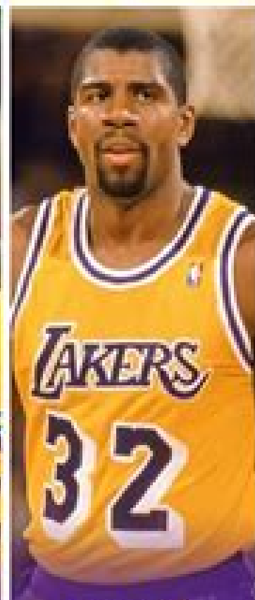
MAGIC JOHNSON ERA