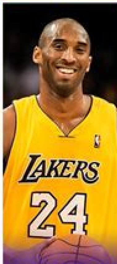
KOBE BRYANT BACK-TO-BACK ERA