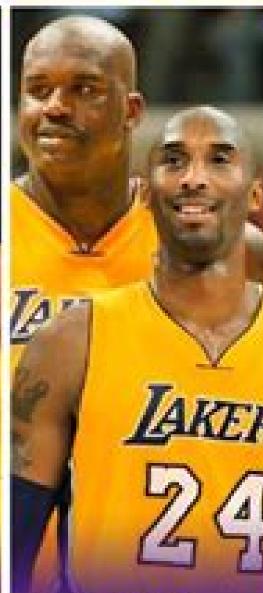
KOBE AND SHAQ ERA