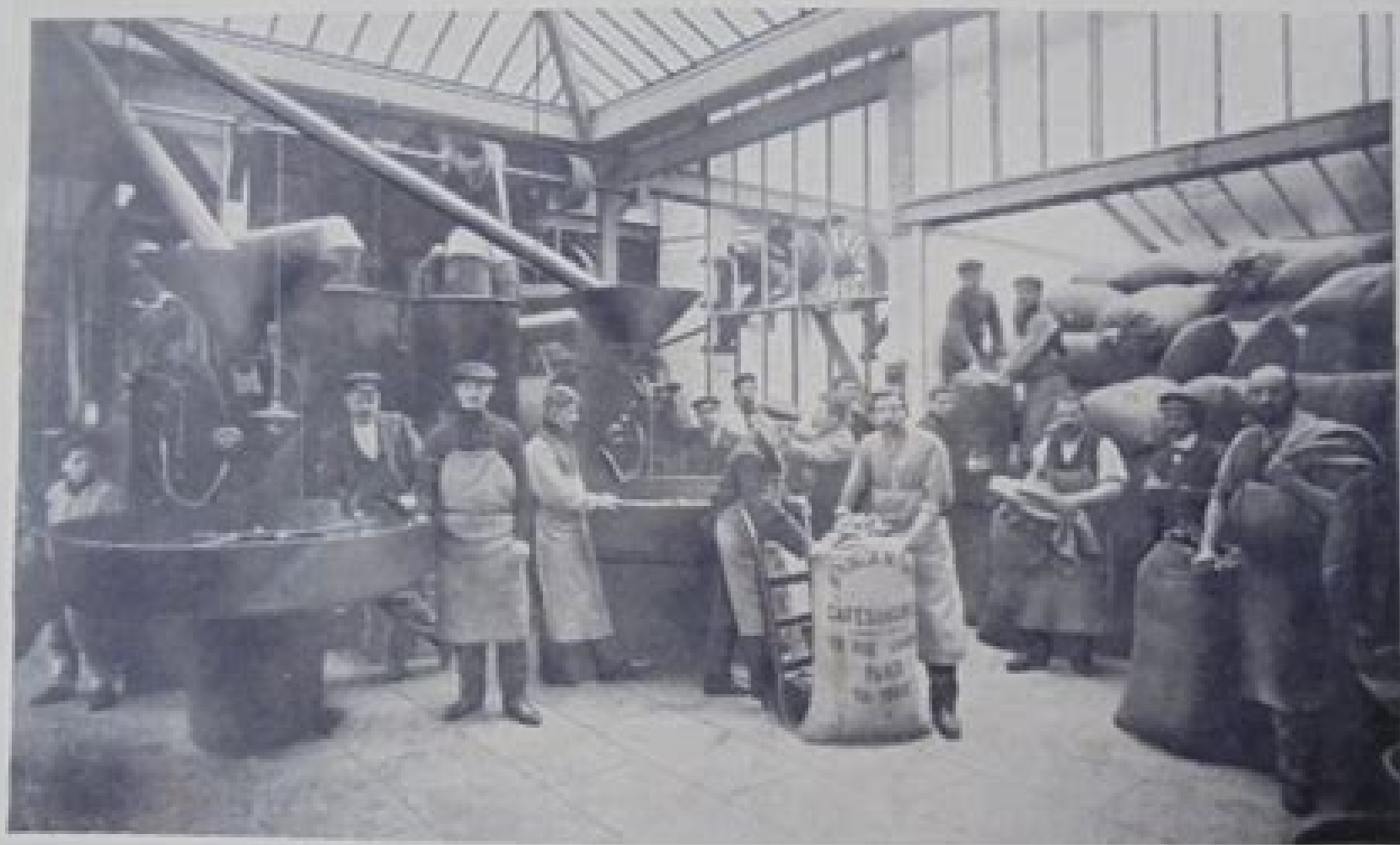
AU PLANTEUR DE GAIFFA, PARIS — Une salle de Torréfaction.