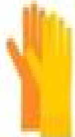
Hand and Arm Protection