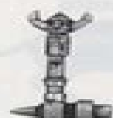
Deathroller Gear Stick 099901906