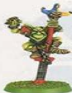
Scrappa Sorehead 099900601 Scrappa Sorehead (1) B 112