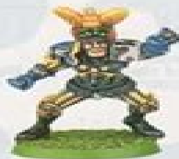
Griff Oberwald 099900701