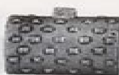
Deathroller Wheel Bottom 099901903