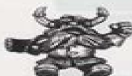
Deathroller Driver 099901901