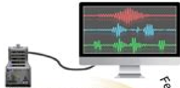
Visualizing signal acquisition system