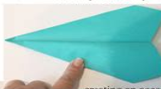
creating an accordion fold