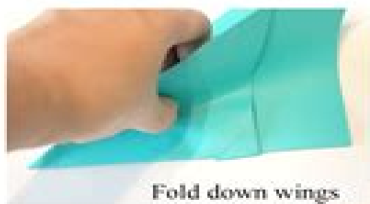
Fold down wings