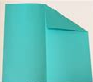
fold down top corners to center line