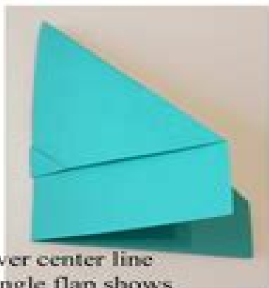
Fold over center line so triangle flap shows