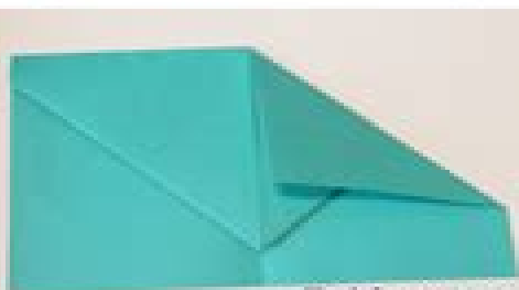
Fold new top corners to center line