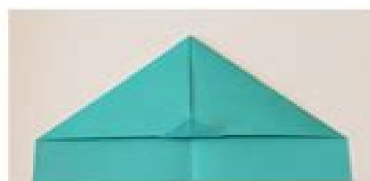
Fold up center flap