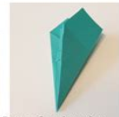
Repeat for other wing