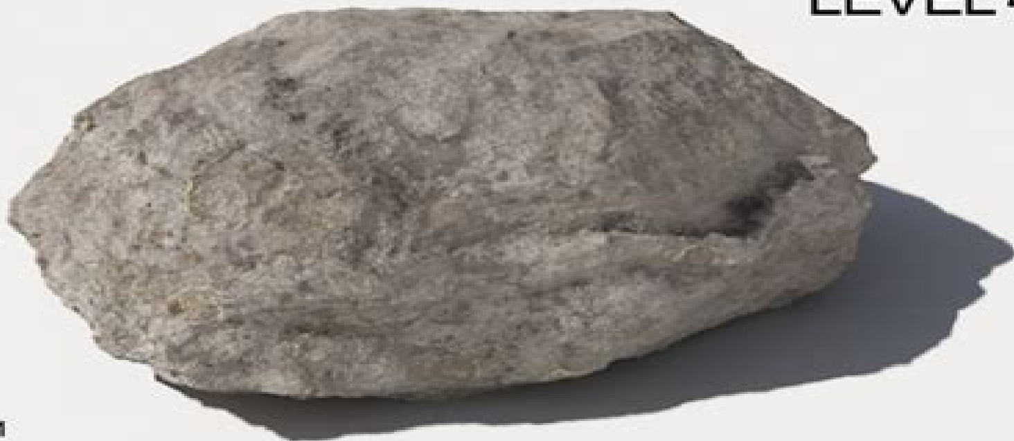
Sample image of: Rocks 6 Smooth RS31