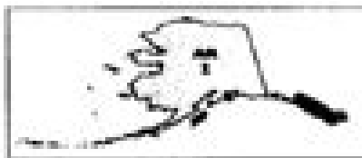
Figure 3. Apportionment of the U.S. House of Representatives for the 106 th Congress