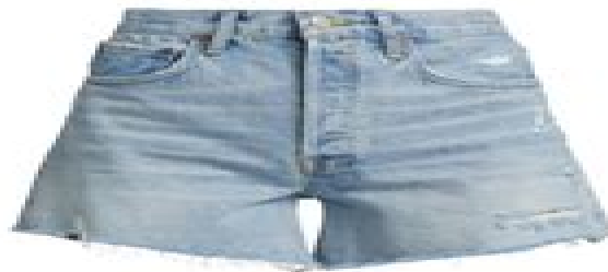
9. CASUAL SHORTS