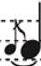
Flam drum technique