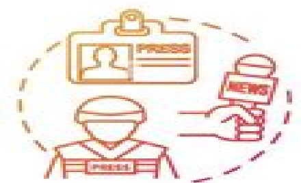
FREEDOM OF PRESS