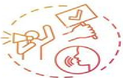
FREEDOM OF EXPRESSION