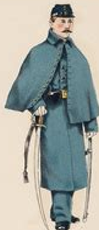
GREAT COAT FOR ALL MOUNTED MEN.