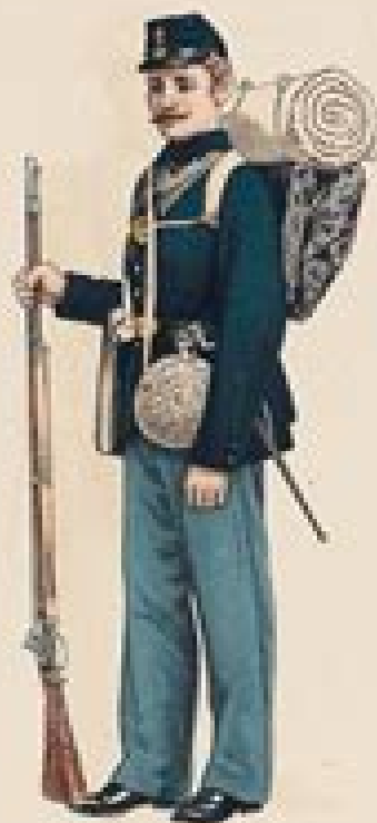
PRIVATE, U.S. CAVALRY. FULL DRESS, MARCHING ORDER.