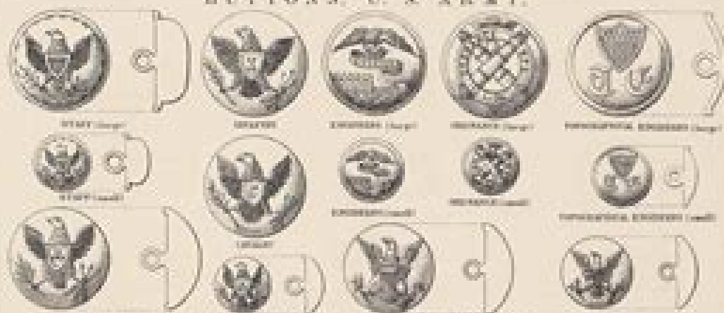
FOR ALL BRIGADES AND REGIMENTS, EXCEPT MOUNTED CAVALRY.