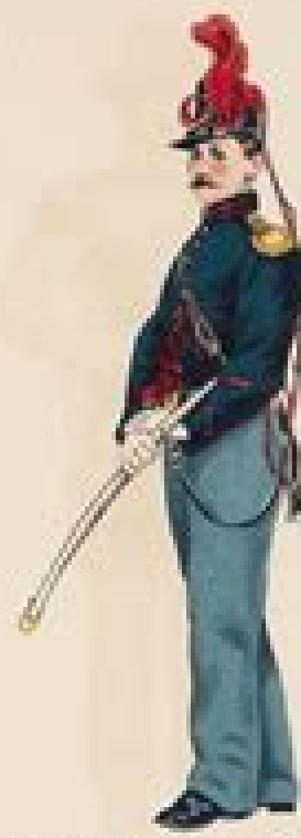
TROOP LEADER, CAVALRY U.S. ARMY. FULL DRESS.