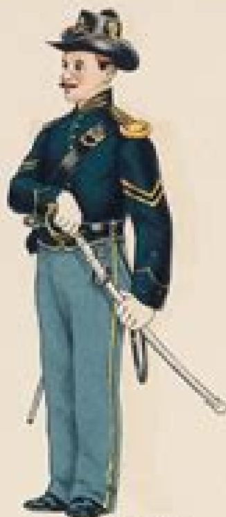
CORPORAL, CAVALRY U.S. ARMY. FULL DRESS.