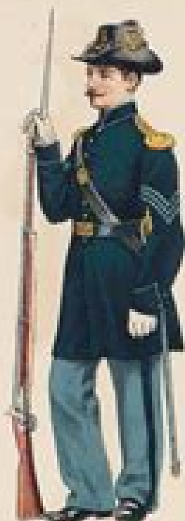
SERGEANT, CAVALRY U.S. ARMY. FULL DRESS.