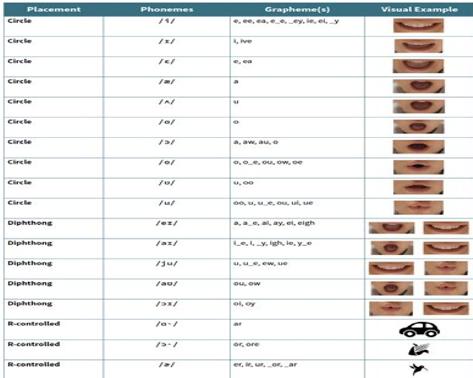
Figure 4: Vowel Sound Wall Information