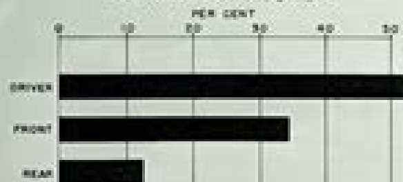
FIG. 20. Seating (spatial) distribution among 880 hospitalized motorist casualties to be discussed in Section III.