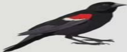
RED WINGED BLACKBIRD