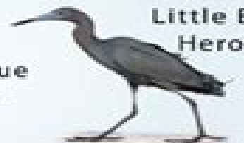
Little Blue Heron