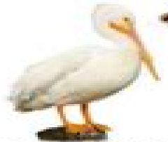
American White Pelican