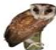
Oriental Bay Owl