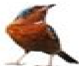
White-throated Rock Thrush