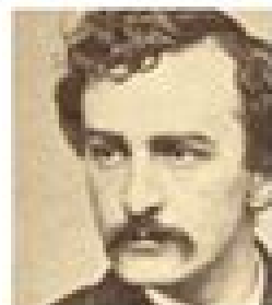
John Wilkes Booth (1838 - 1865)