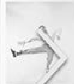
Fred Astaire (1899 - 1987)