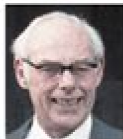
Denis Thatcher (1915 - 2003)