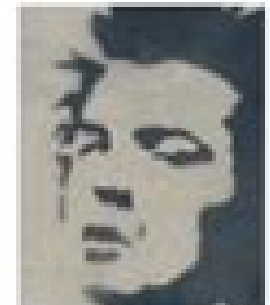
Sid Vicious (1957 - 1979)