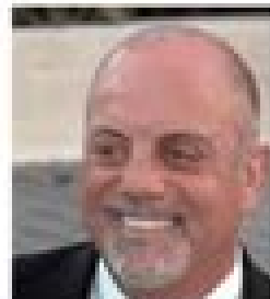
Billy Joel (67)