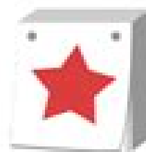
Albert Finney (80)