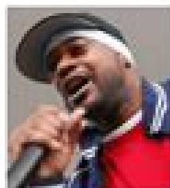
Ghostface Killah (46)