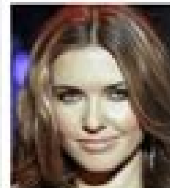
Audrina Patridge (31)