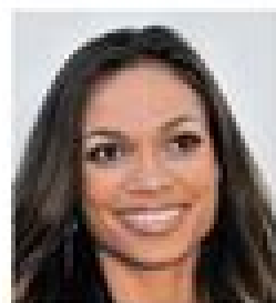
Rosario Dawson (37)