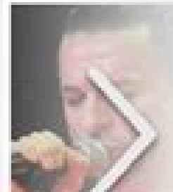
Dave Gahan (54)