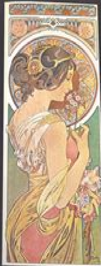
178. LA FEMME EN ROUGE (FERNÉ DE L'ARTISTE, 1898)